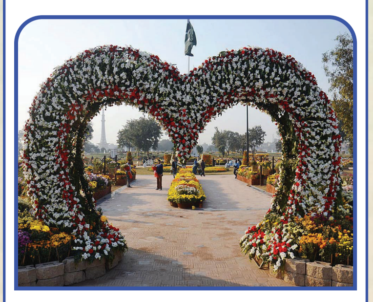
Explore the historic charm of lqbal Park, a tribute to Pakistan's national poet. A green oasis in the heart of Lahore

Results://maps.app.goo.gl/mdF4a12NvwMqf7SM6